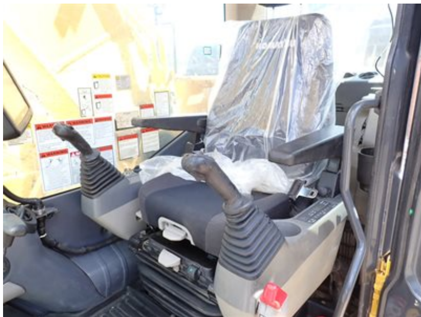
Seating / Interior