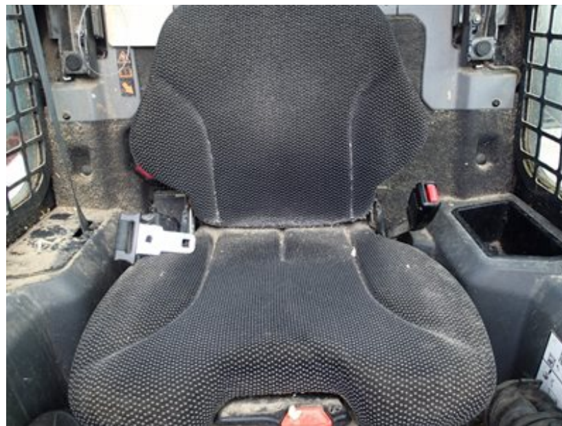
Seating / Interior