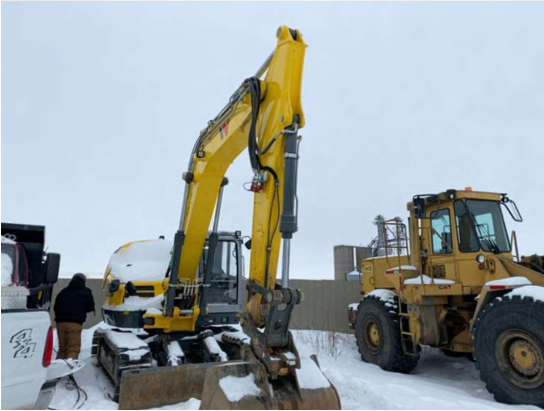
Boom Arm Right / 02-15-2021