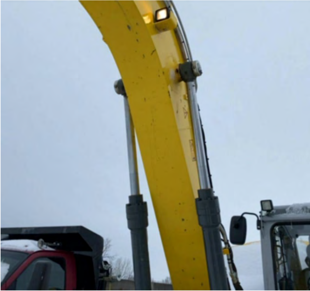
Working Light Non Operational / 02-16-2021