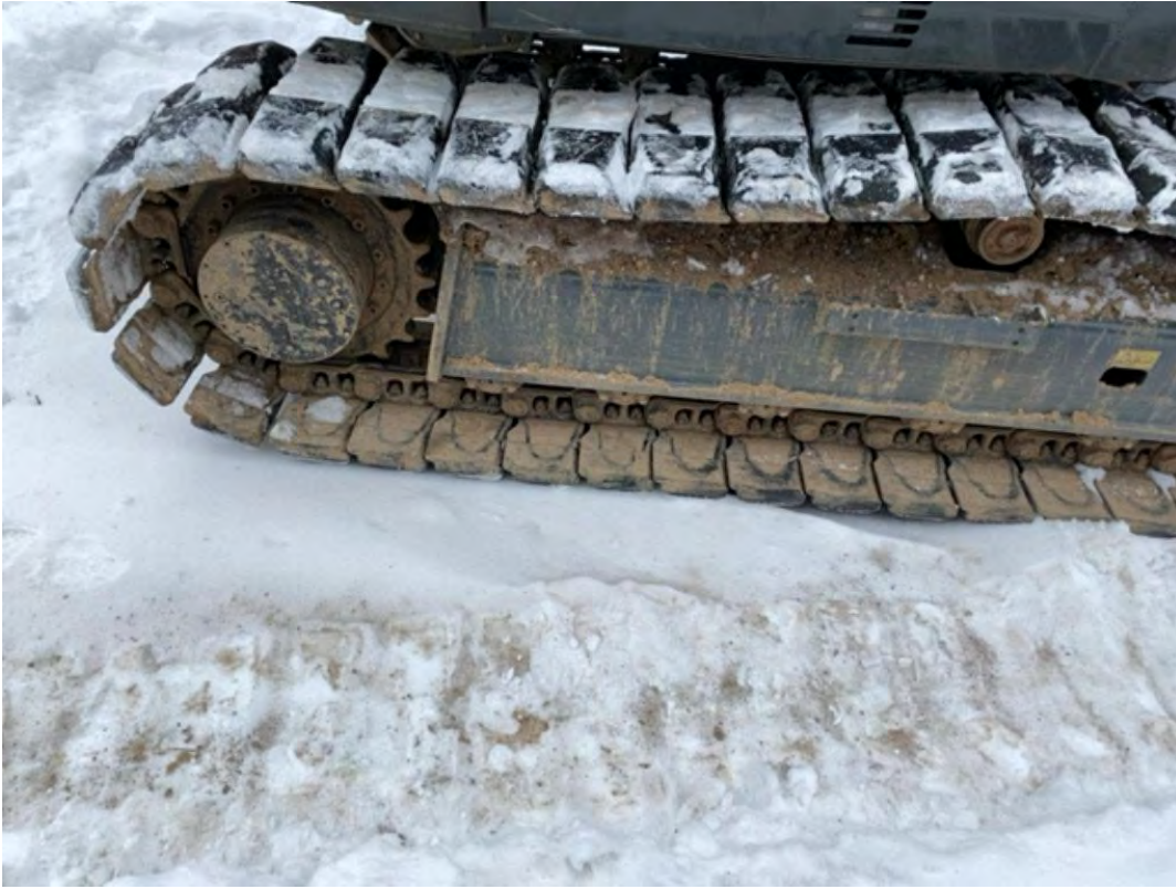
Left Track Rollers / 02-15-2021