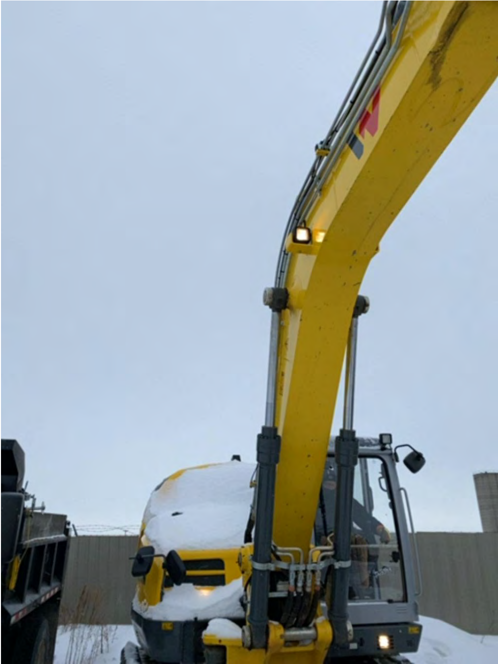
Working Lights / 02-15-2021