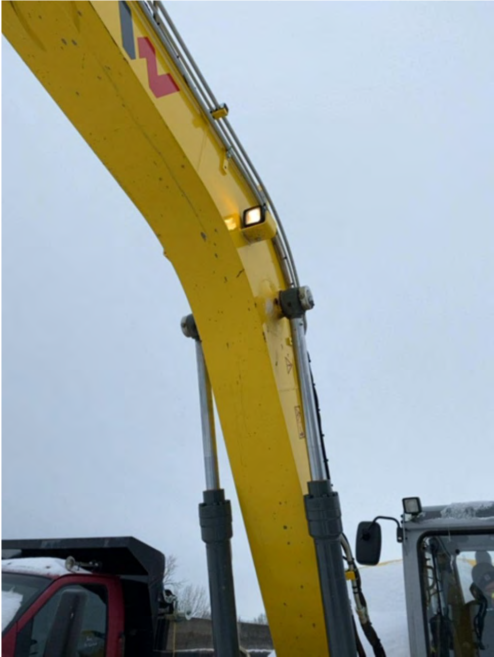
Working Lights / 02-15-2021