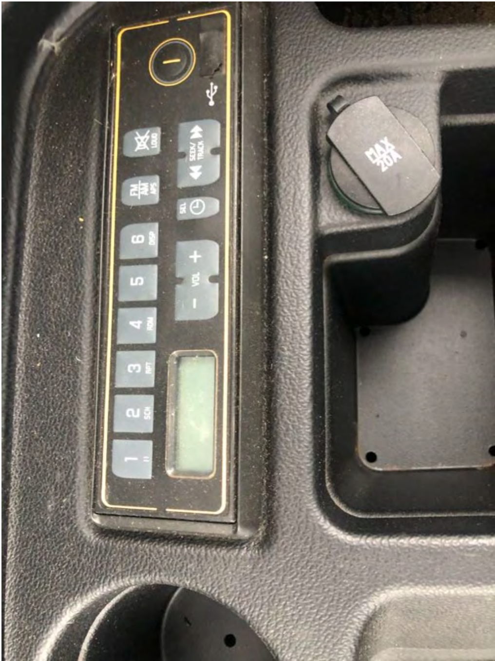
Radio / 02-16-2021