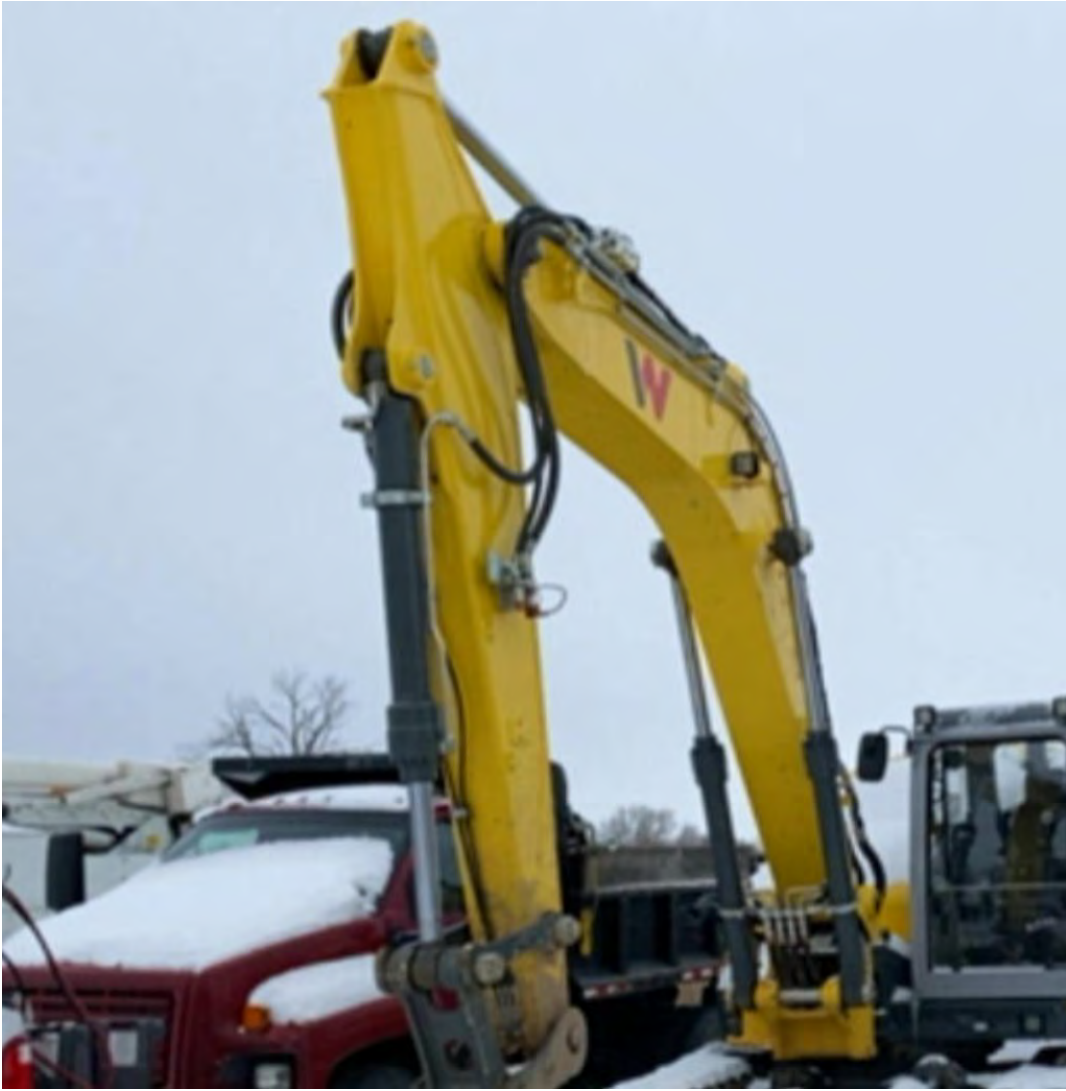
Boom Arm Left / 02-15-2021