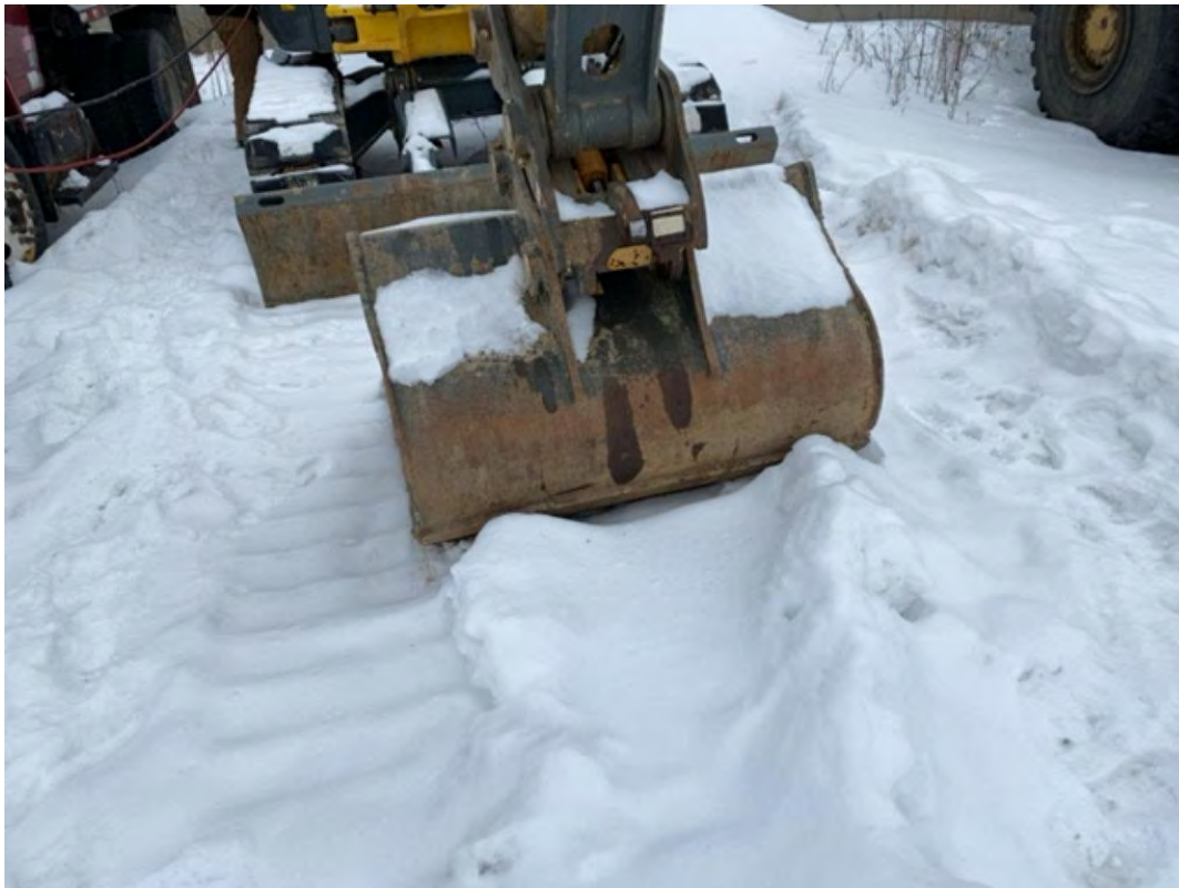
Attachment Serial Plate Not Visible / 02-15-2021