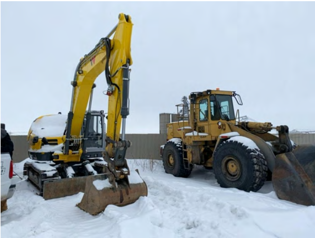
Front Right / 02-15-2021