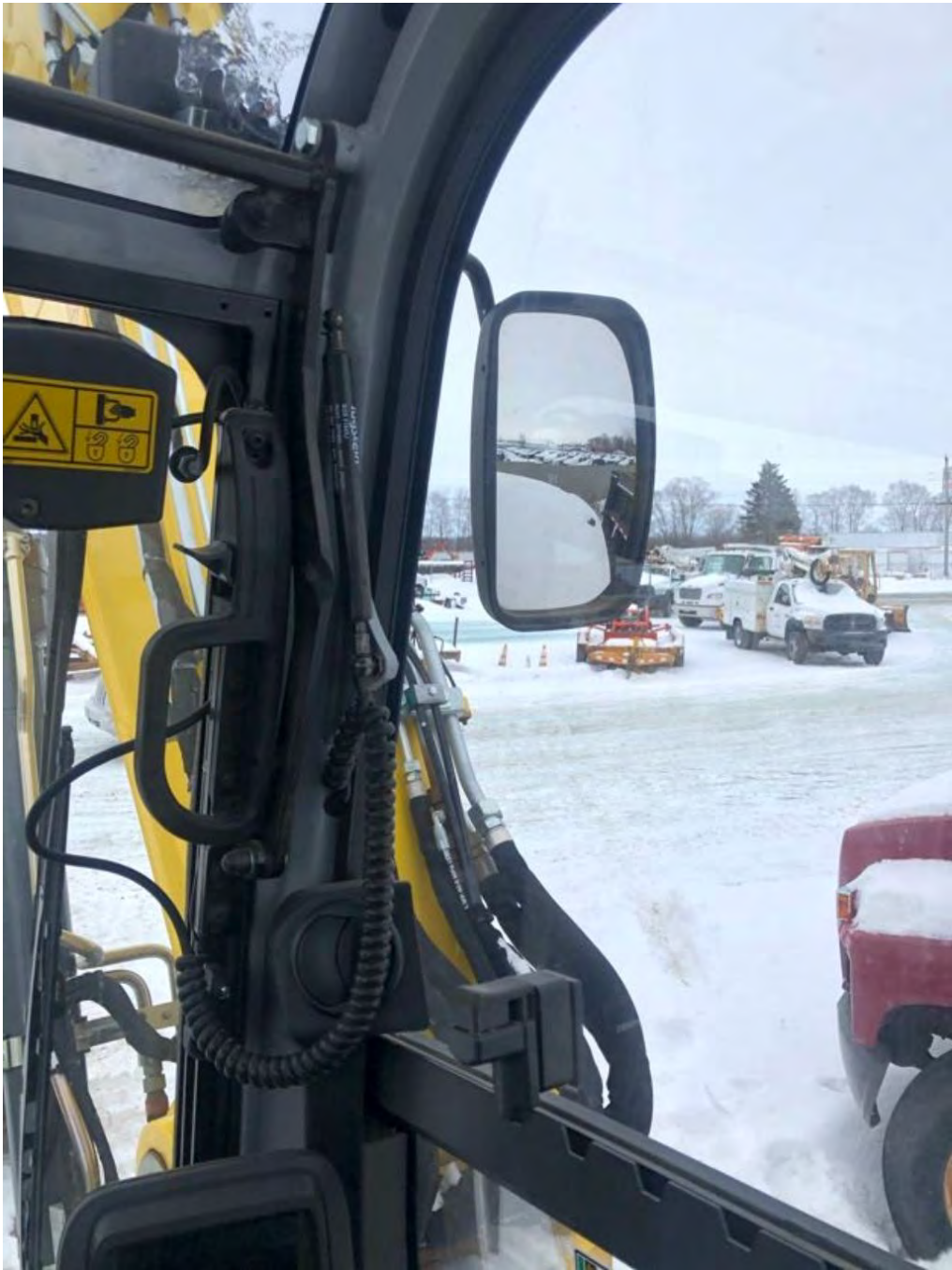
Right Mirror / 02-16-2021