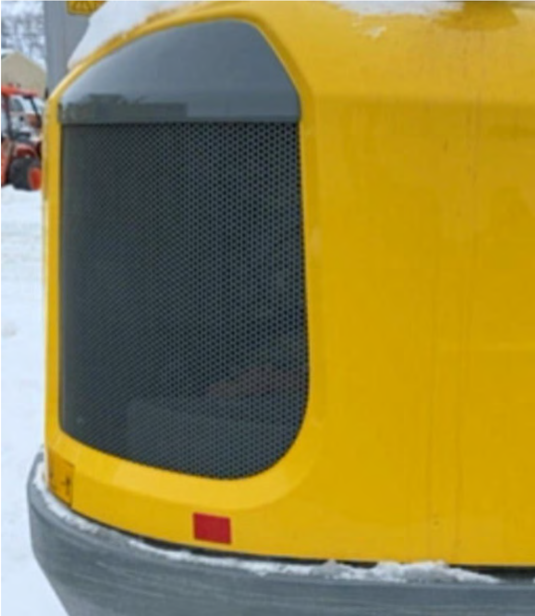
Intake Screen / 02-15-2021