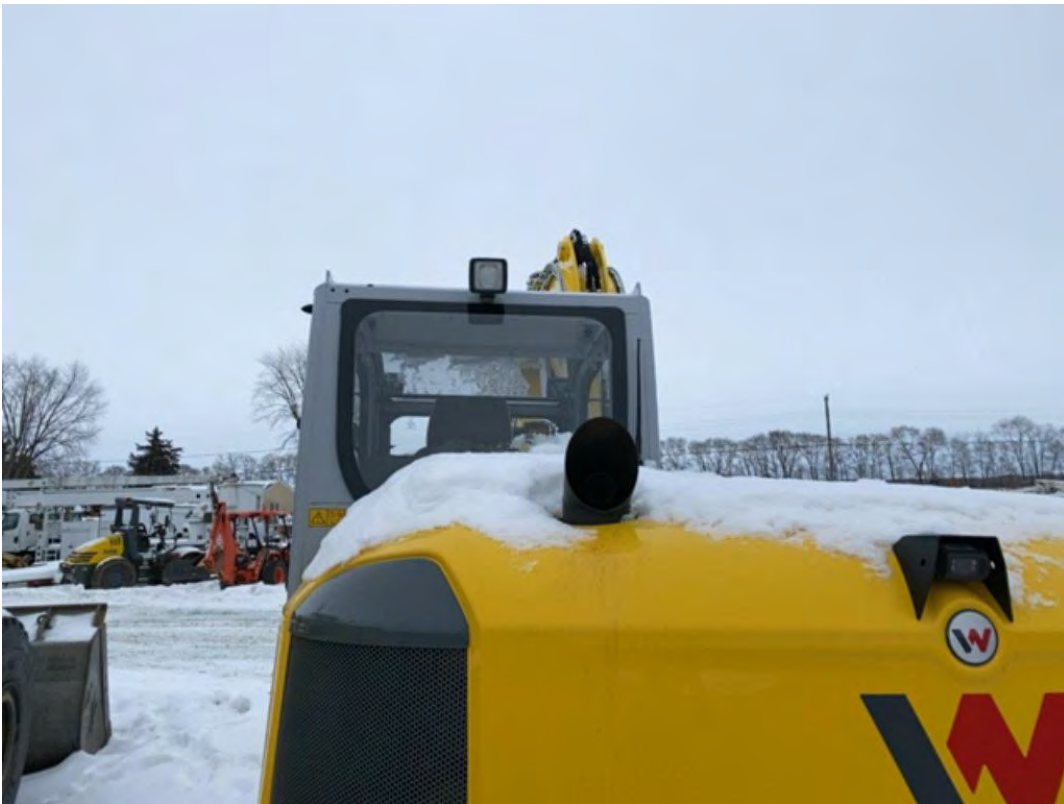
Rear Glass / 02-15-2021