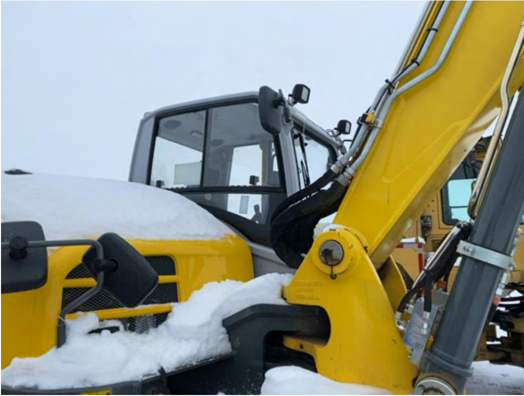
Right ROPS / 02-15-2021