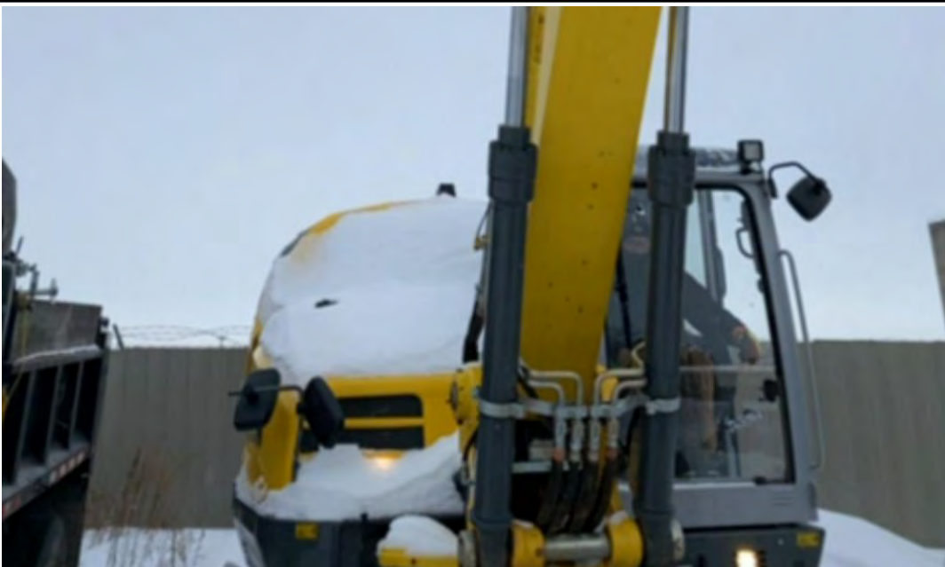
Working Light Non Operational / 02-16-2021