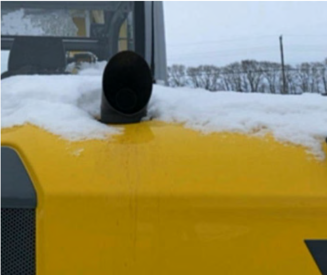
Muffler / 02-15-2021