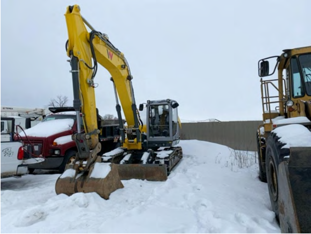
Front Left / 02-15-2021