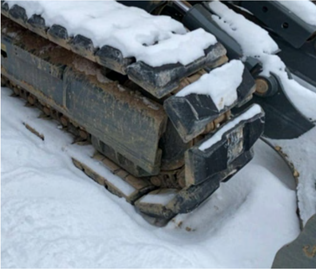
Right Track Idler / 02-16-2021