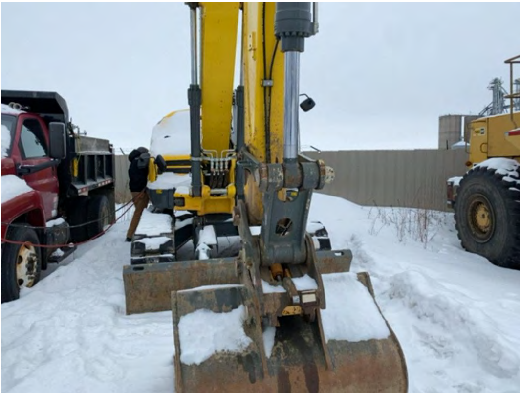
Bucket Cylinder / 02-15-2021