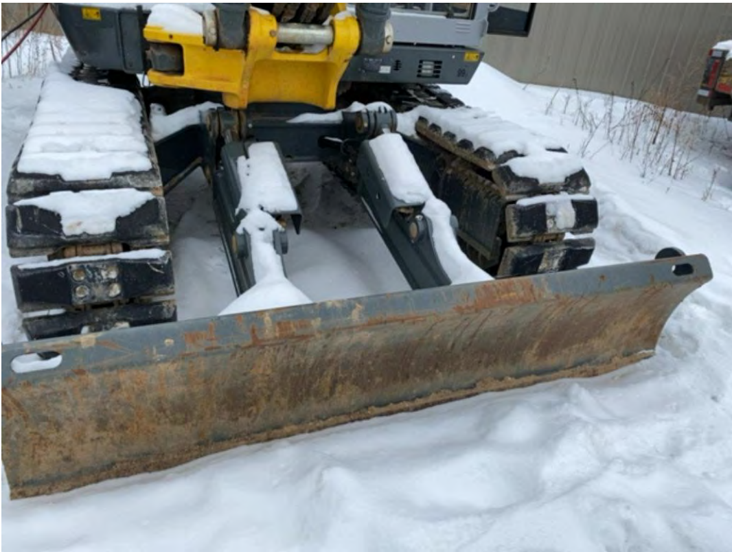
Blade / 02-15-2021