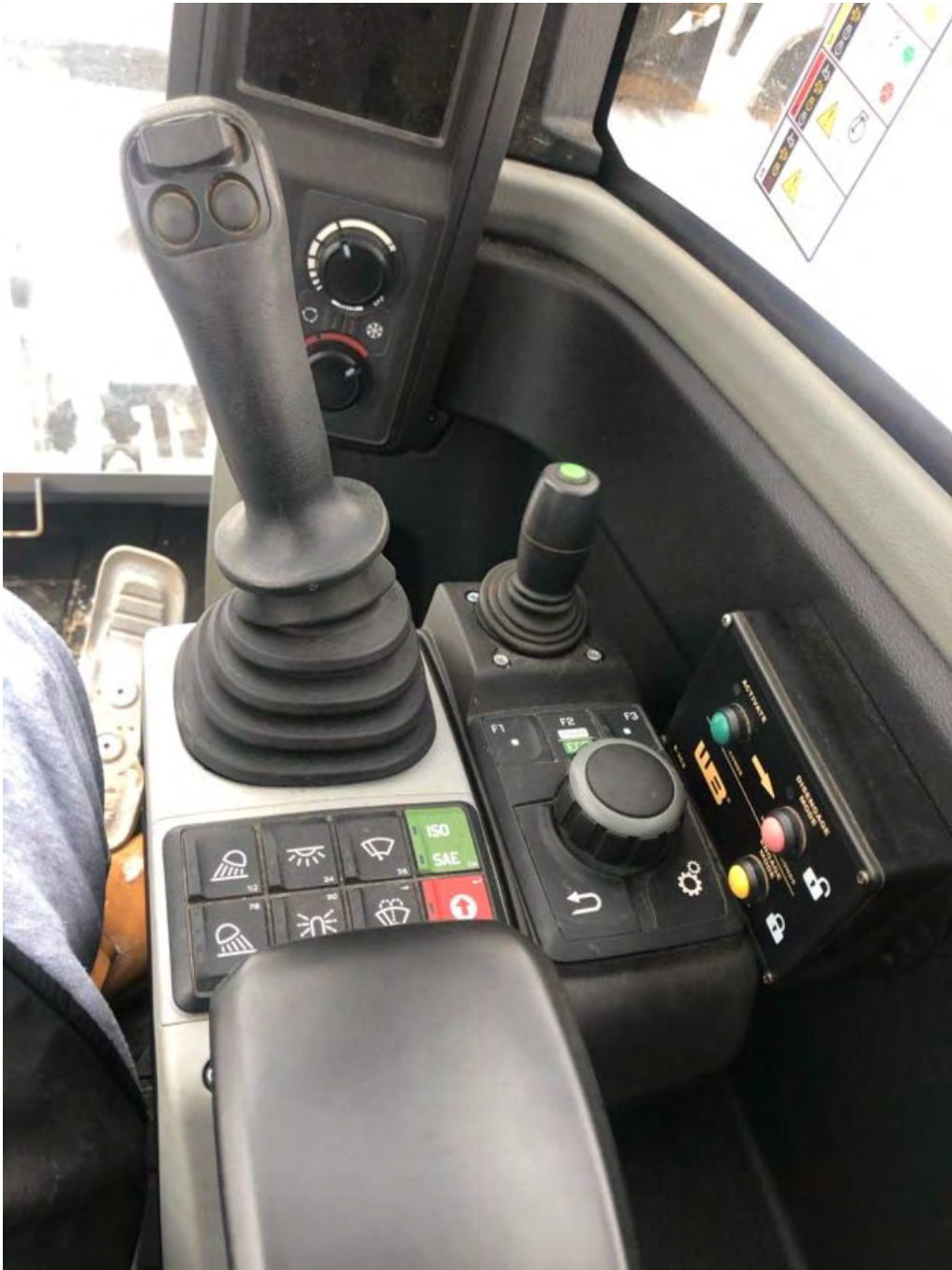
Right Control / 02-16-2021