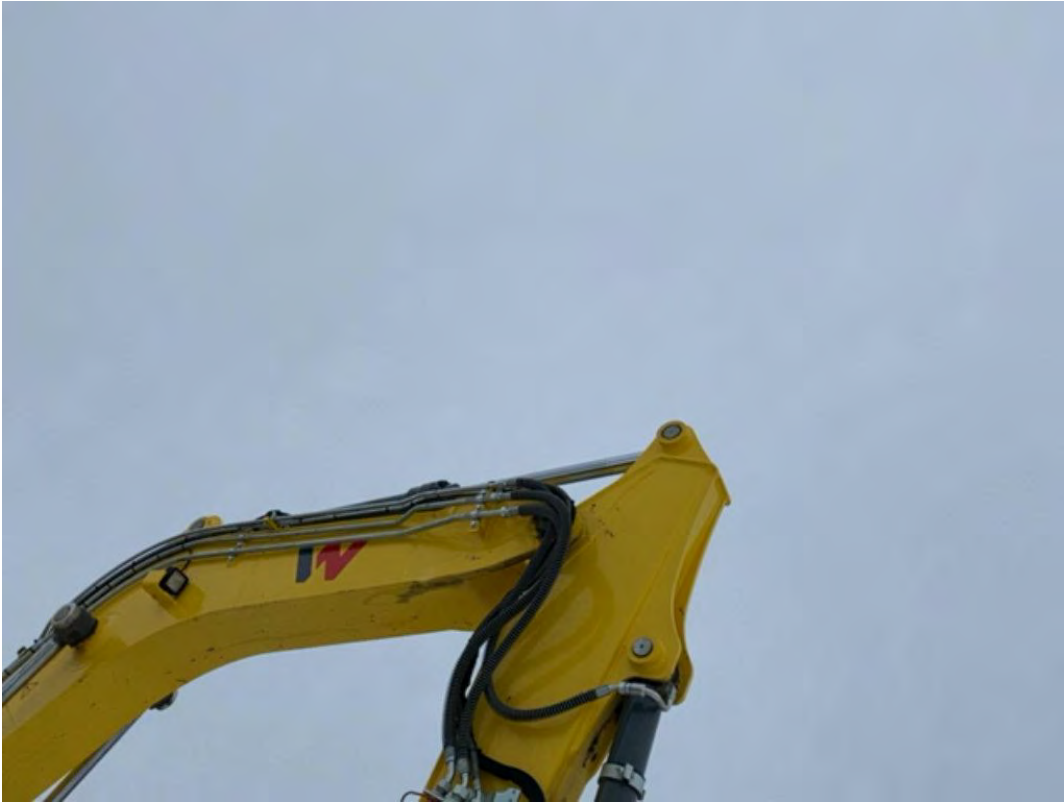
Stick Cylinder / 02-15-2021