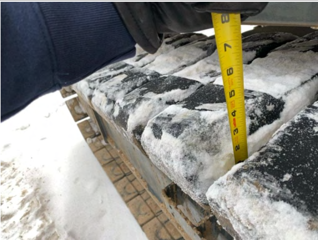
Right Track Tread Depth Measurement / 02-15-2021