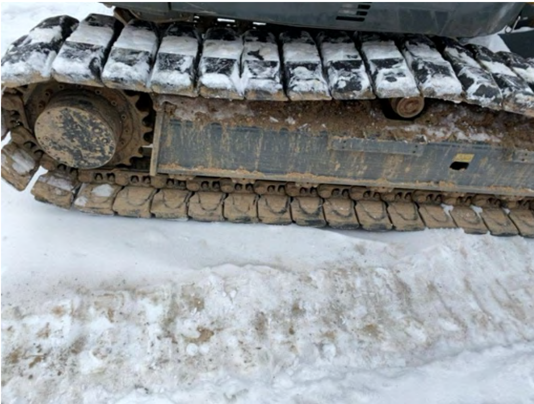
Left Track Sprocket / 02-15-2021