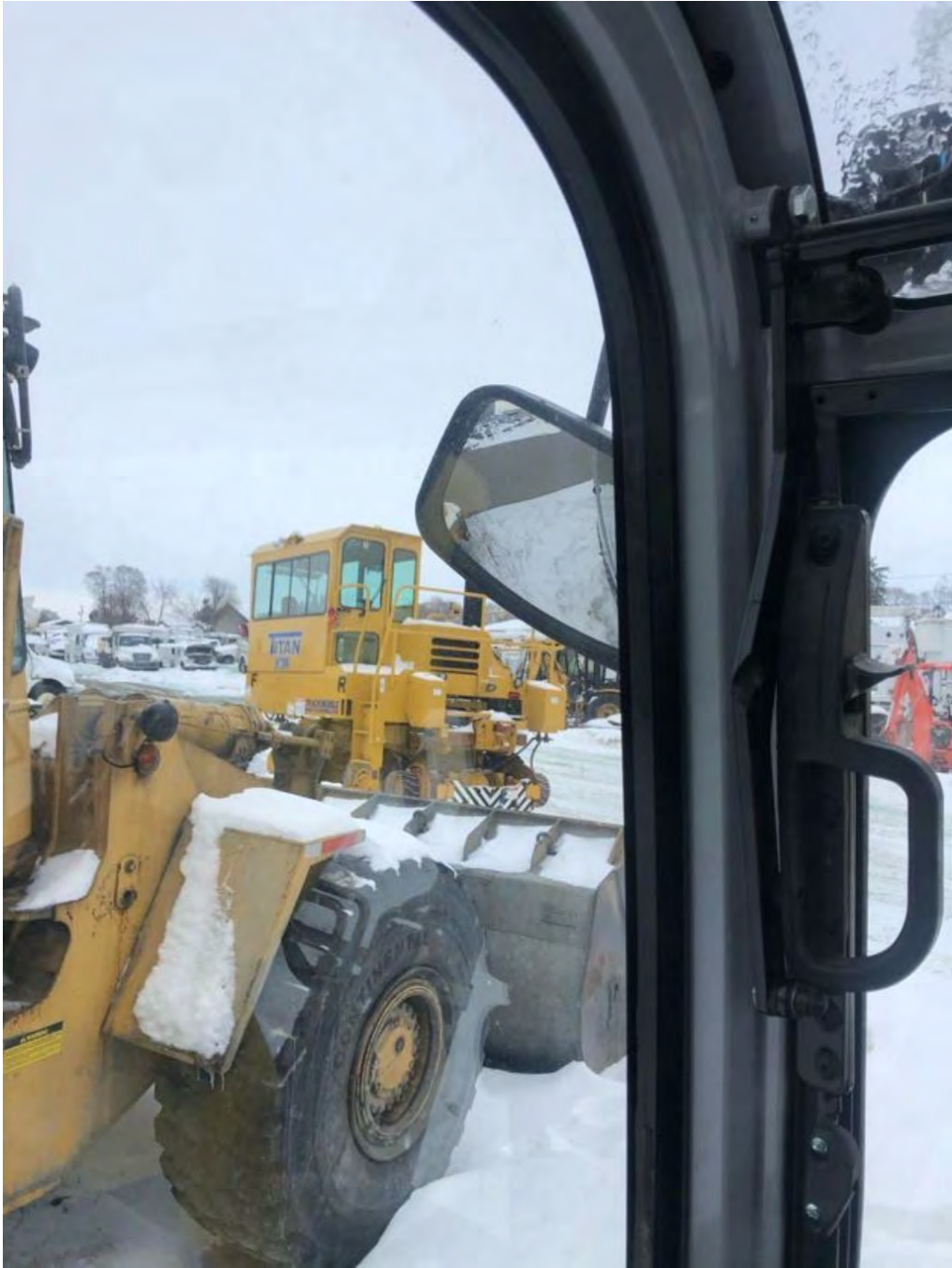
Left Mirror / 02-16-2021