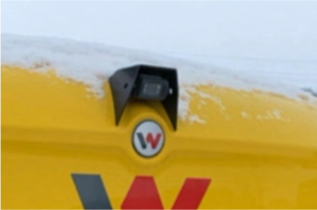
Backup Camera / 02-15-2021