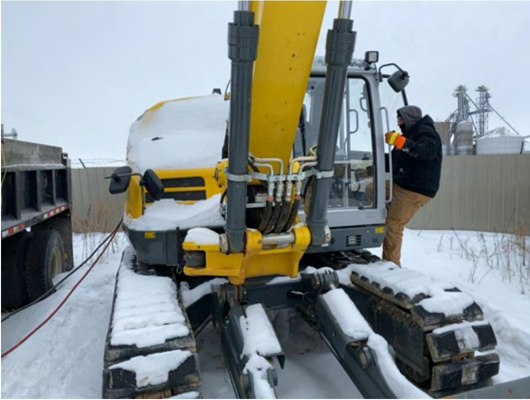
Hydraulic Lines / 02-15-2021