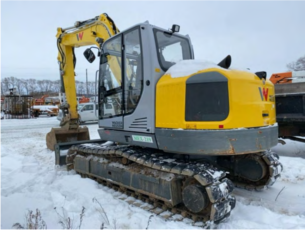
Rear / 02-15-2021