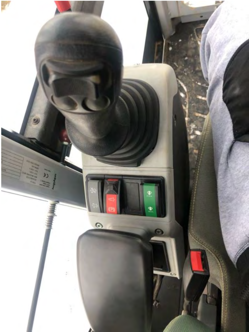
Left Control / 02-16-2021