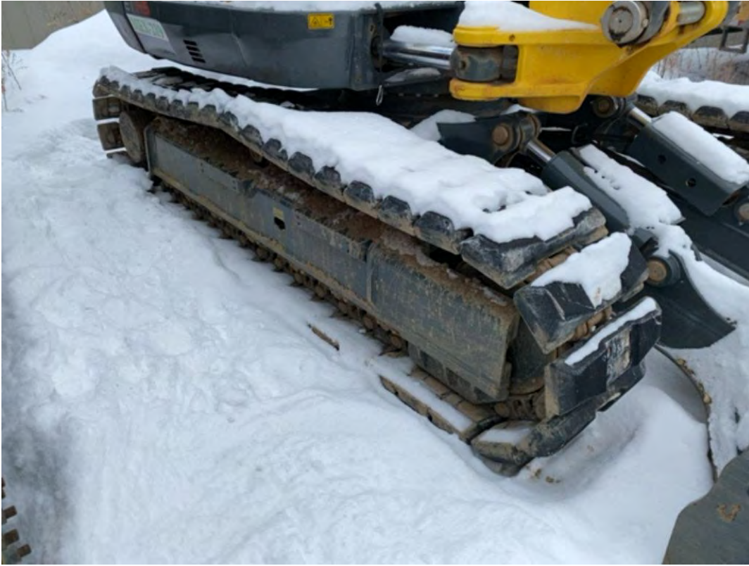
Right Track Condition / 02-15-2021