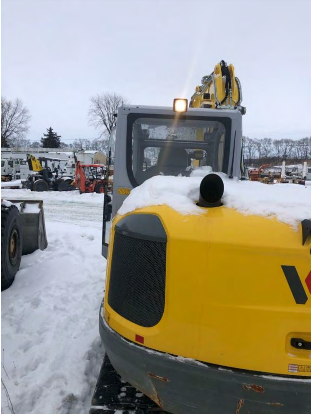
Rear Light / 02-16-2021