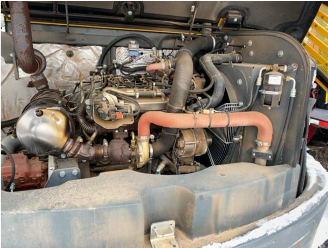
Engine MFR Not Visible / 02-15-2021