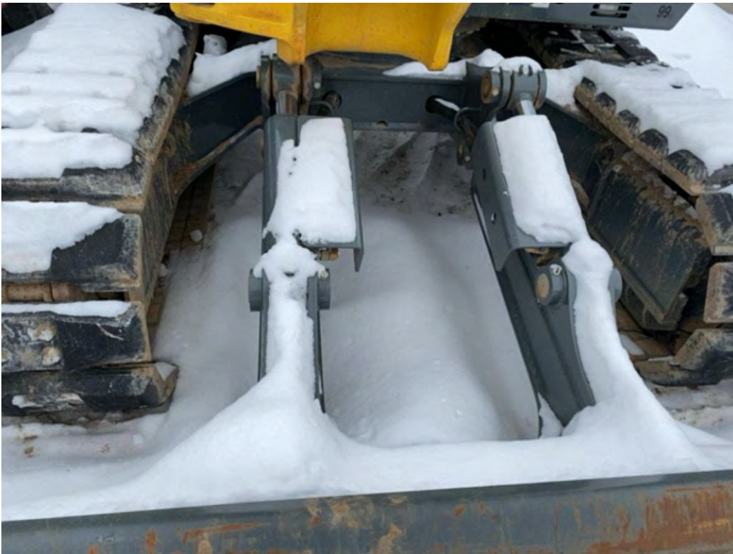
Blade Cylinders / 02-15-2021