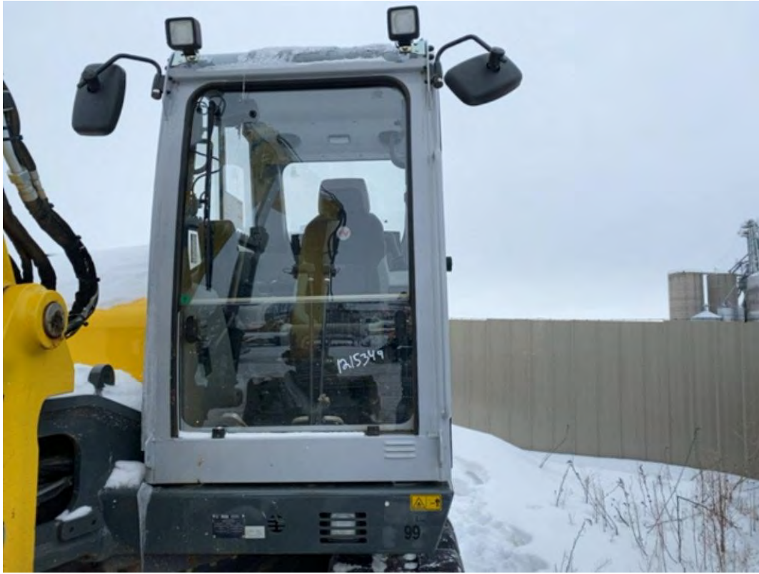
Front ROPS / 02-15-2021