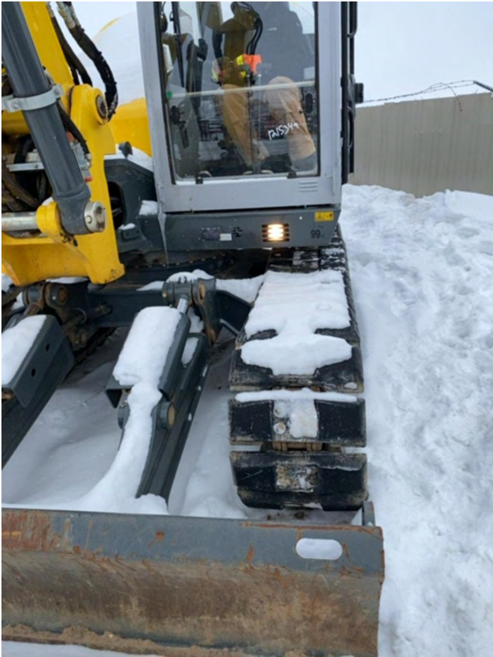
Working Lights / 02-15-2021