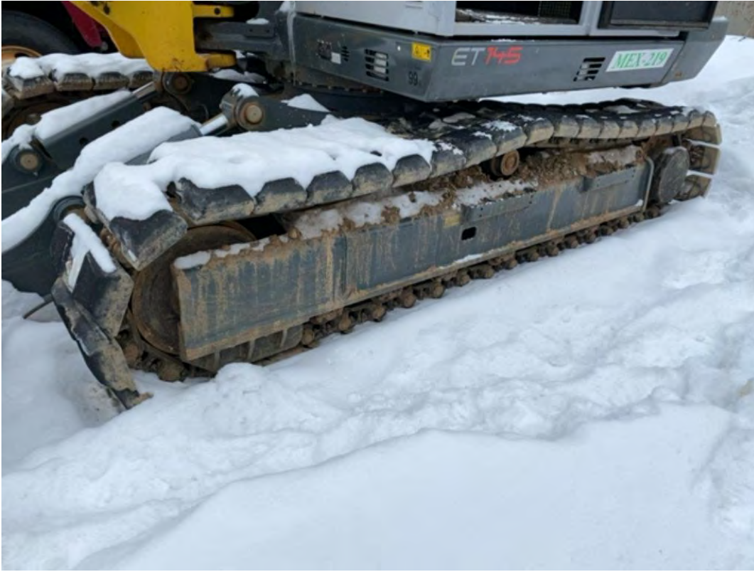
Left Track Condition / 02-15-2021