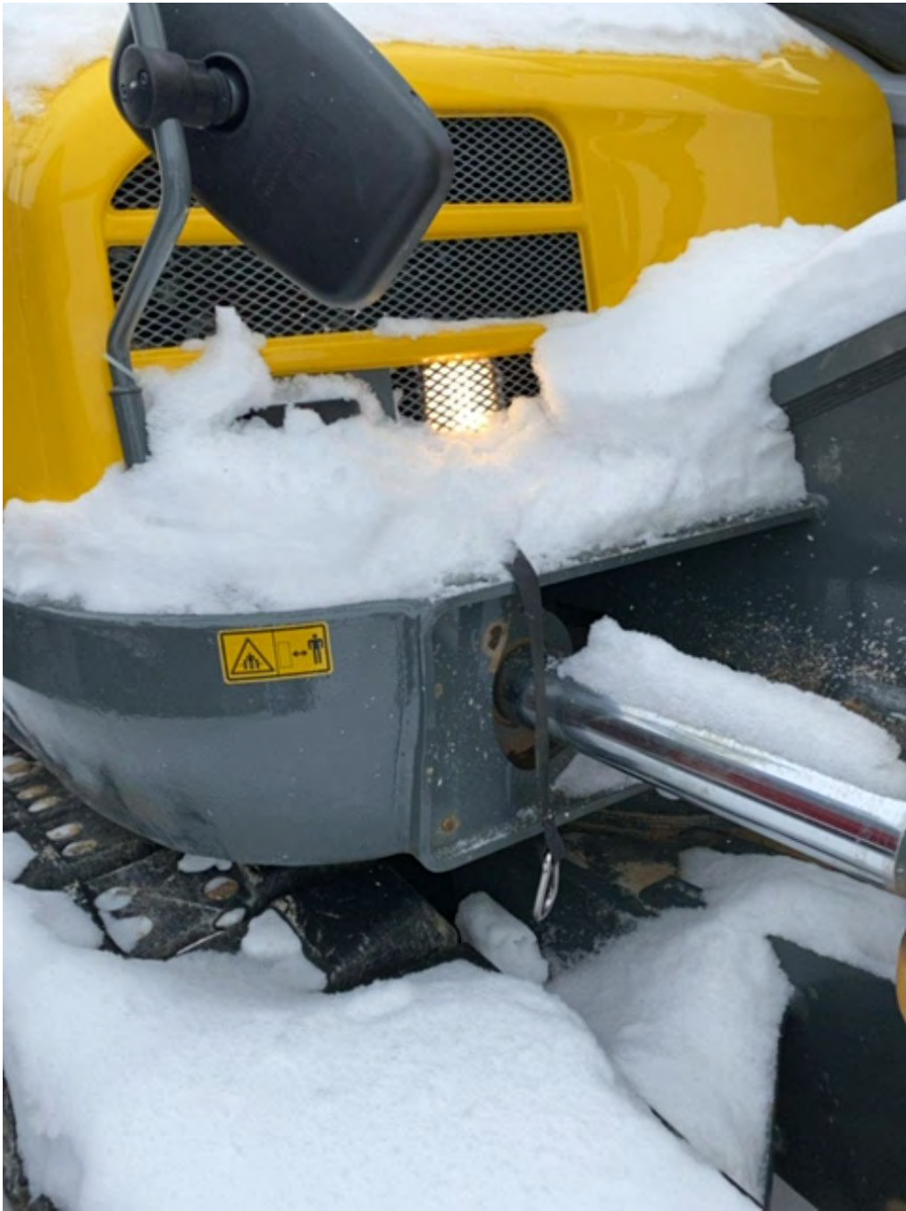
Working Lights / 02-15-2021