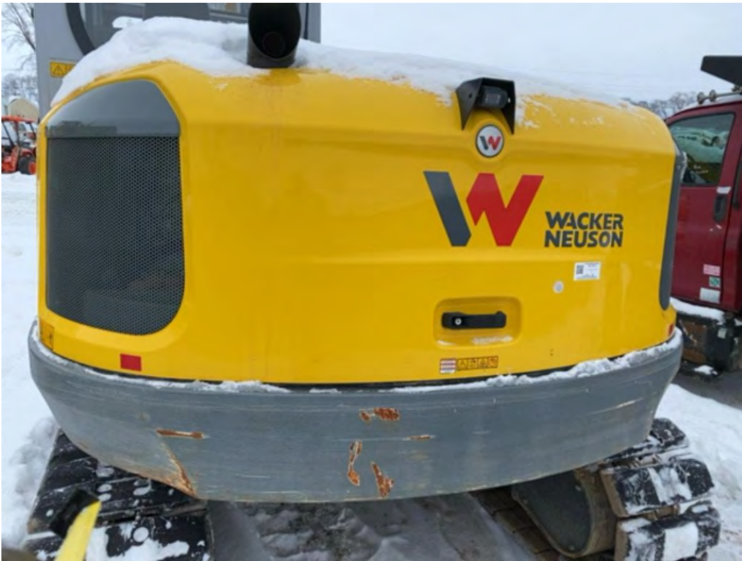
Engine Door / 02-15-2021