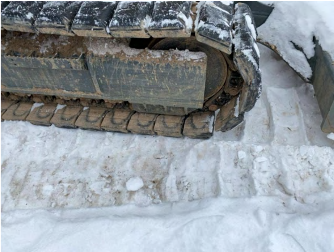
Left Track Rollers / Left Track Idler / 02-15-2021