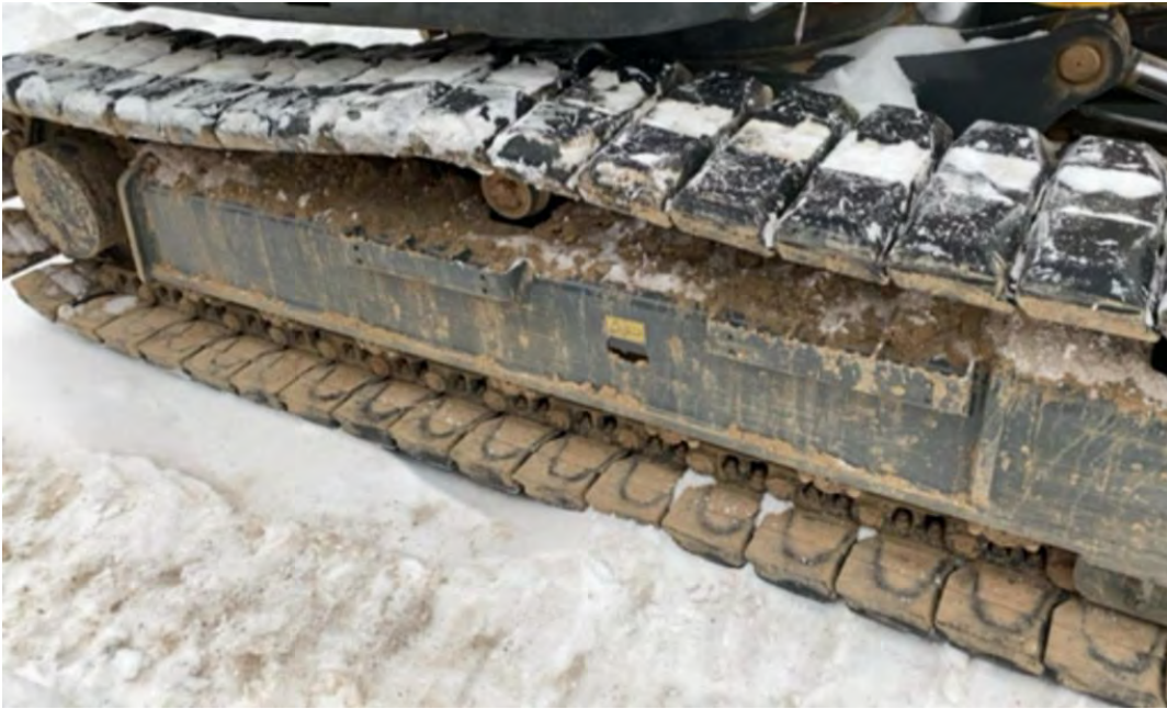
Right Track Sprocket / Rollers / 02-16-2021