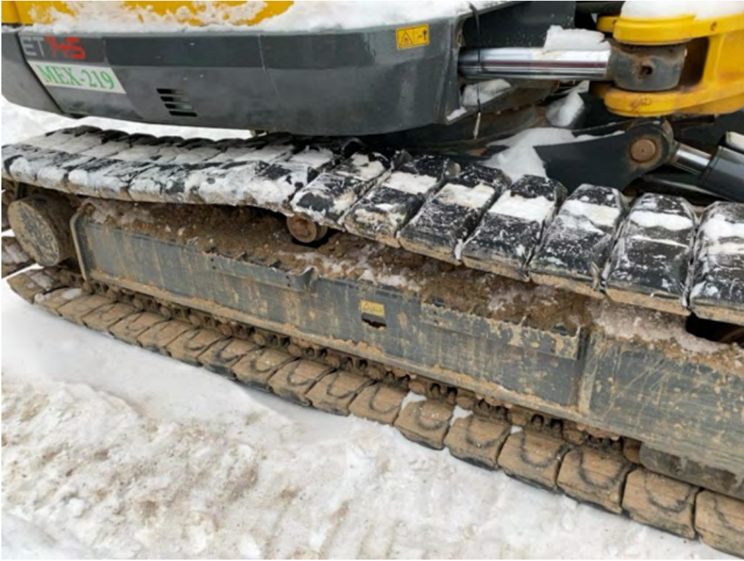
Swing Cylinder / 02-15-2021