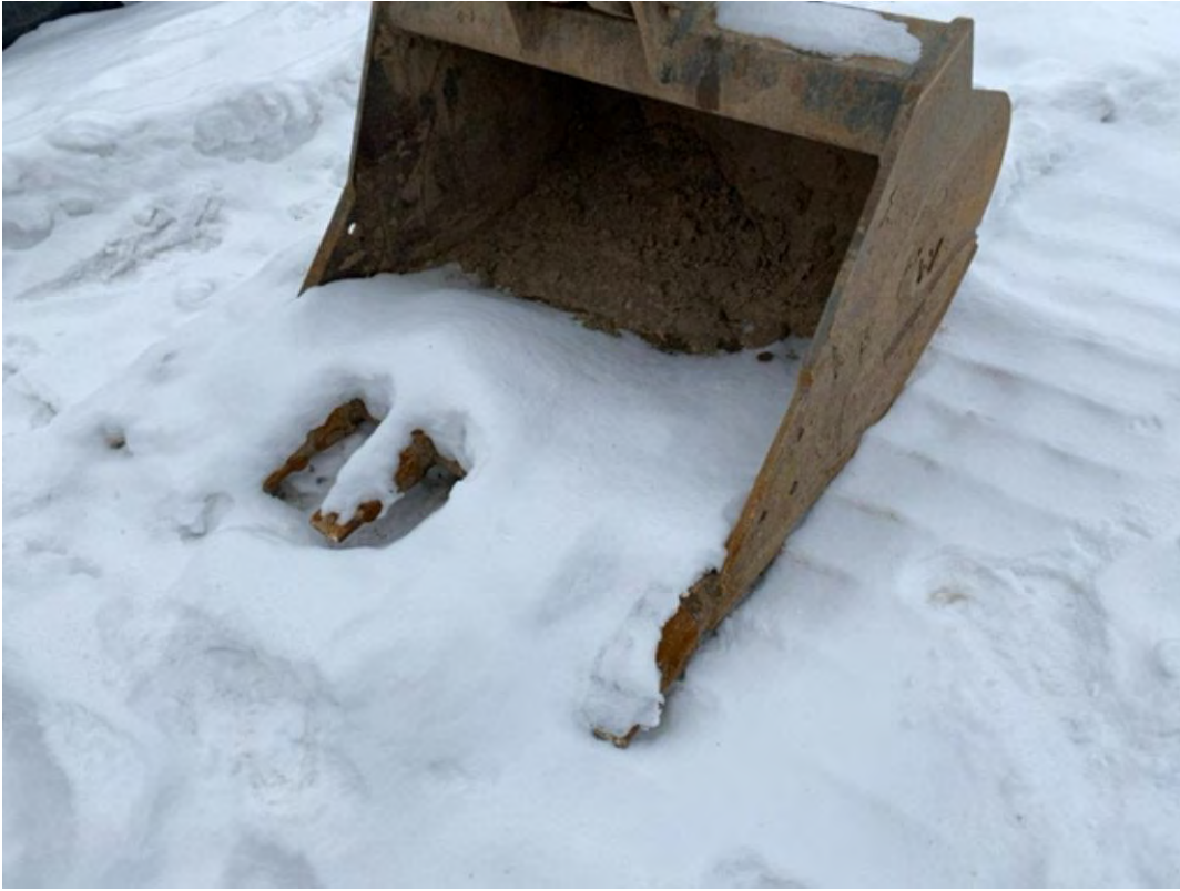
Bucket Attachment / 02-15-2021