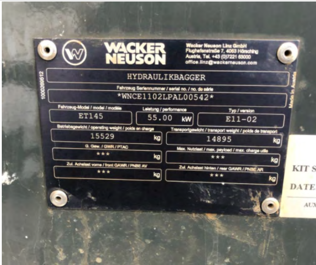
WNCE1102LPAL00542 / Serial # / VIN # / 02-16-2021