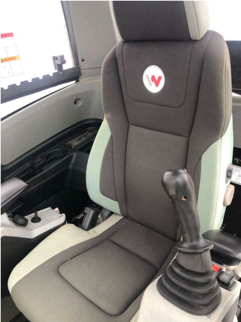
Seat / 02-16-2021