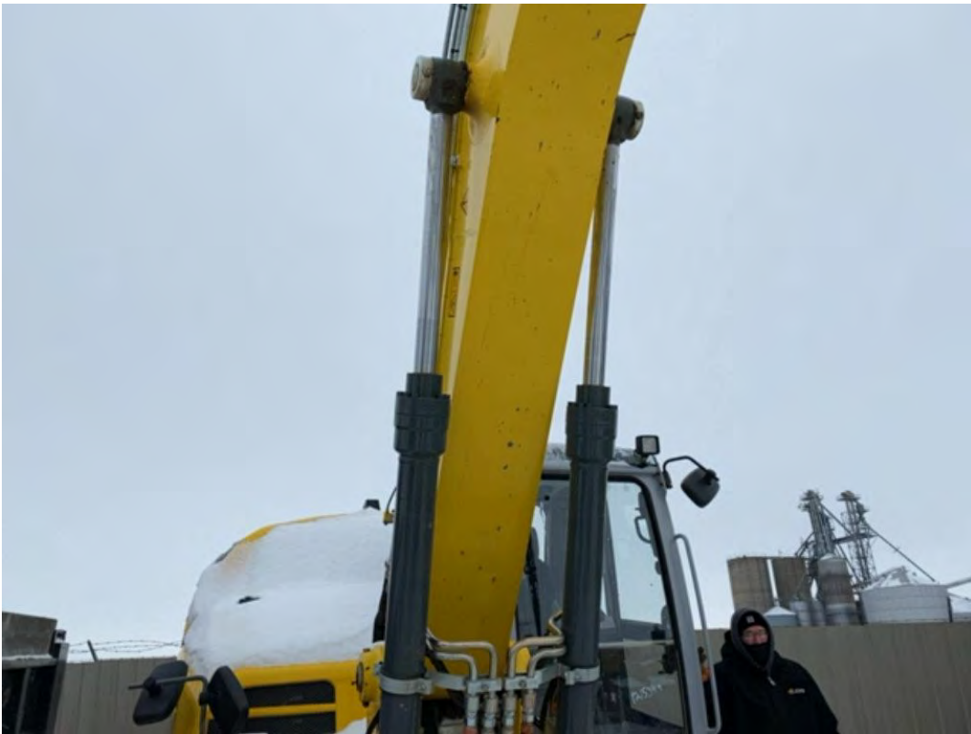
Boom Cylinders / 02-15-2021