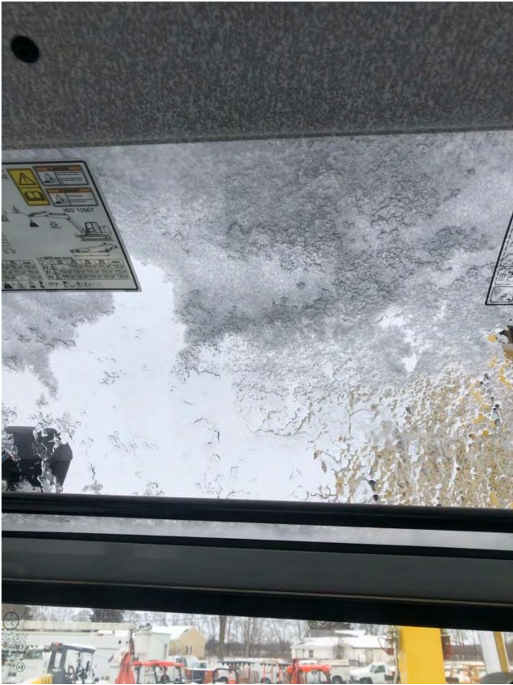
Top Glass / 02-16-2021