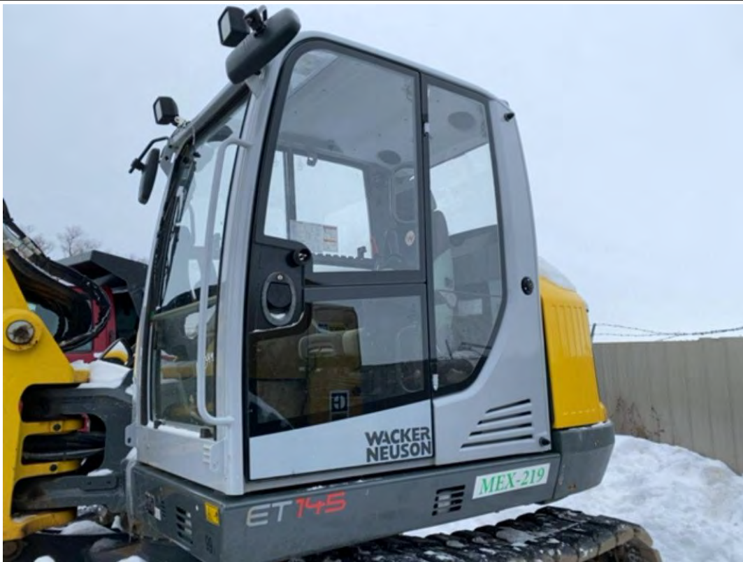
Left ROPS / Cab Door / 02-15-2021