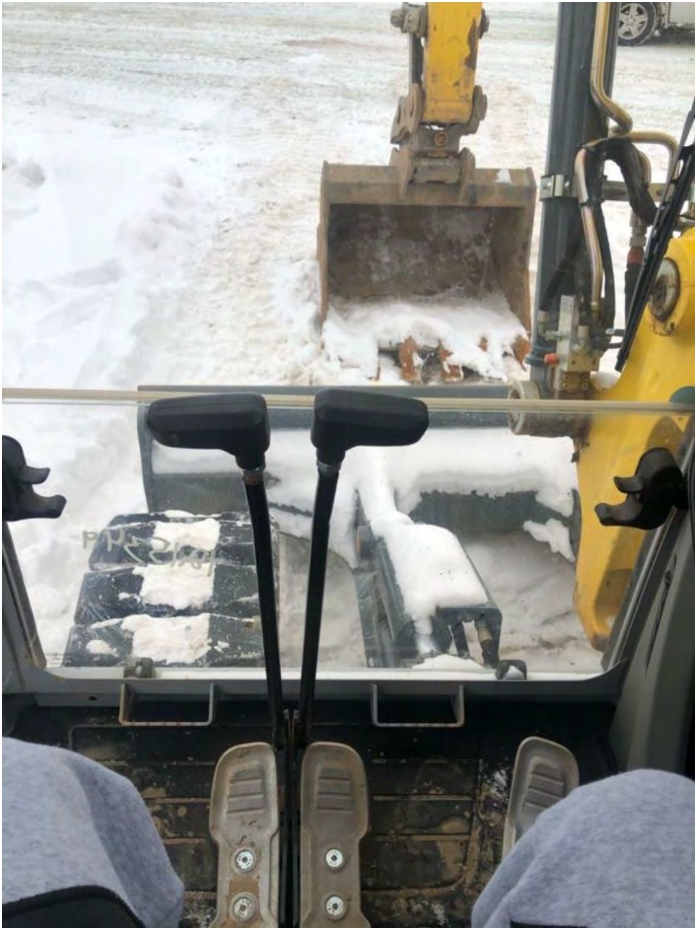
Hand Controls / 02-16-2021