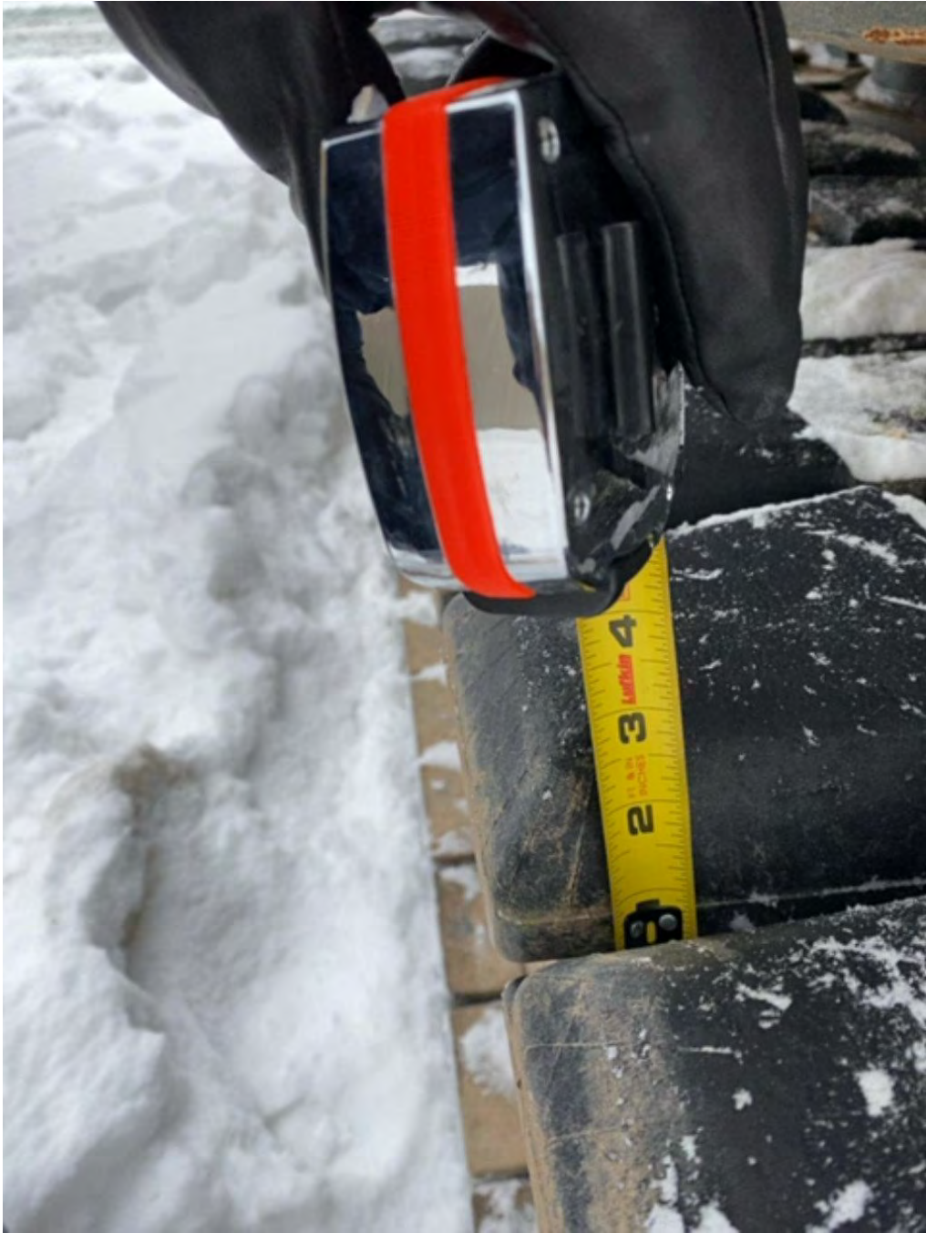
Left Track Tread Depth Measurement / 02-15-2021