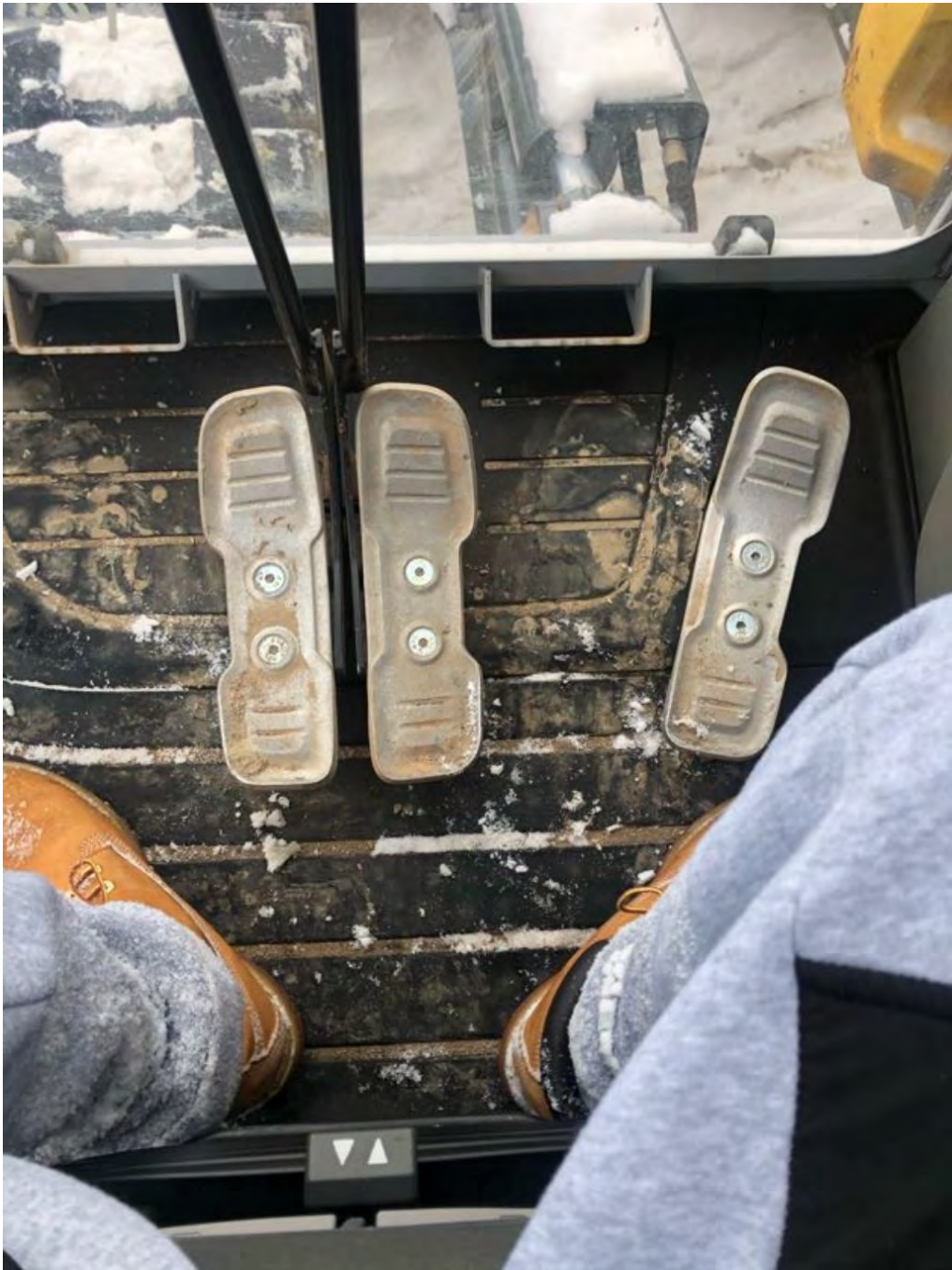
Pedals / 02-16-2021