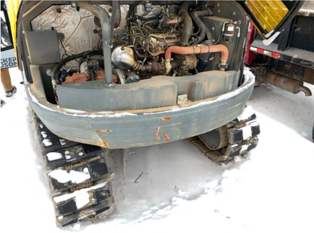
Engine Compartment / 02-15-2021