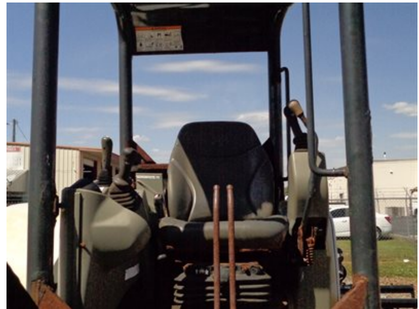
Seating / Interior